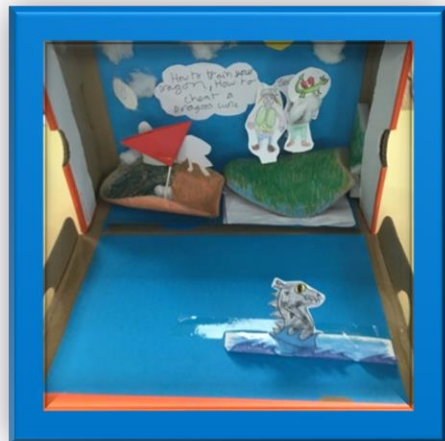
David M -

We are inclusive, confident, and enterprising learners who are brave, curious, optimistic, and kind. We are ready to embrace the future!