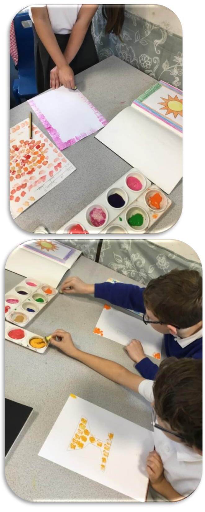
The Romans made their mosaics out of small gems and stones called tesserae which they stuck to the floor with mortar. Patterns and pictures would often show scenes from Roman life. Having a mosaic in your home was a sign of wealth and importance.

KIND HANDS, KIND FEET, KIND WORDS, KIND ACTIONS