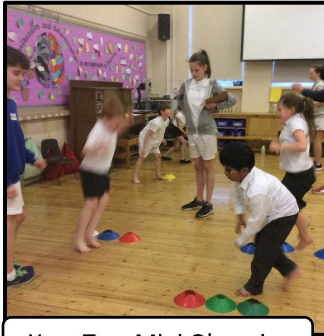
Year Two Mini Olympics