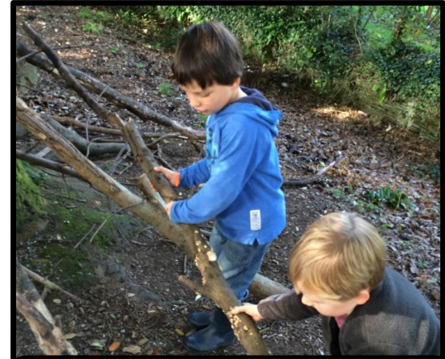
Outdoor and Adventurous Activities